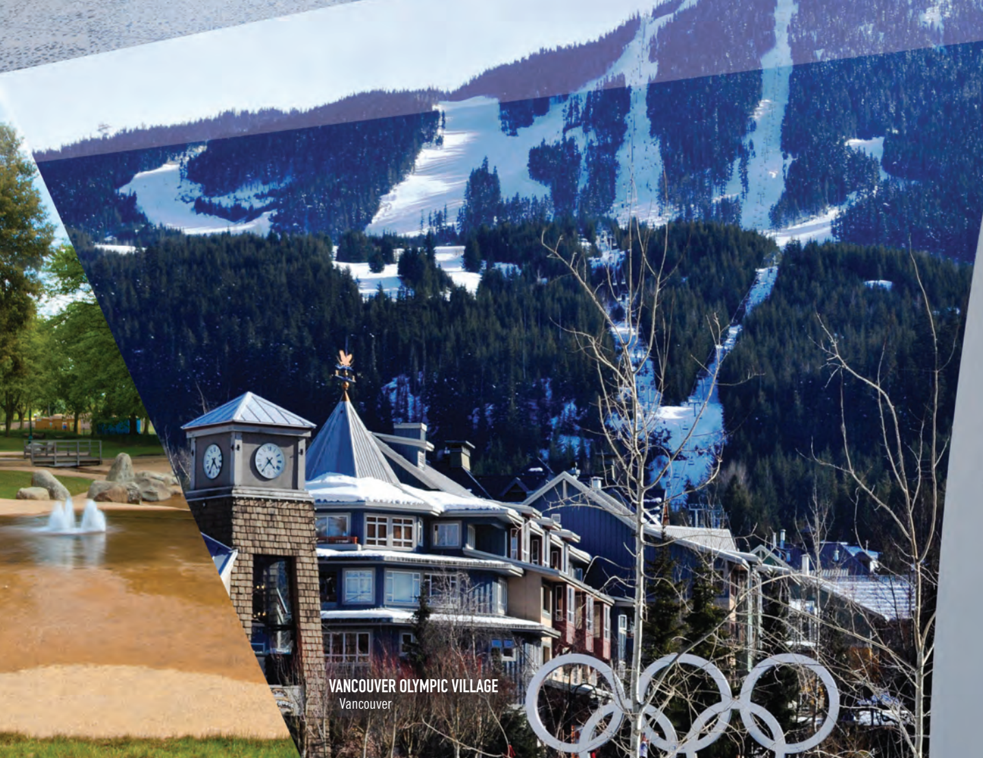
VANCOUVER OLYMPIC VILLAGE Vancouver